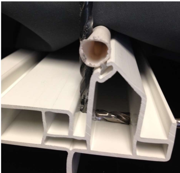
Weep Hole Drilling

2) Next install the window into your wall opening and secure through the jambs using a pan head screw in the recessed area around the frame as shown in Fig. 6. Use a high quality pure silicone to seal your window around the perimeter.