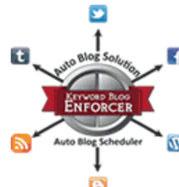
Auto Post Solution