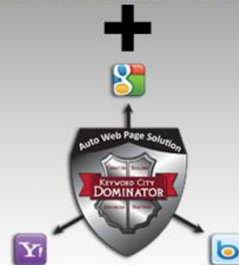
Auto Web Page Solution