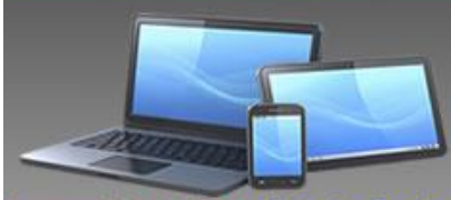
Internet Marketing + Website Design All-in-One Website Solution