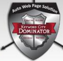
Auto Web Page Solution