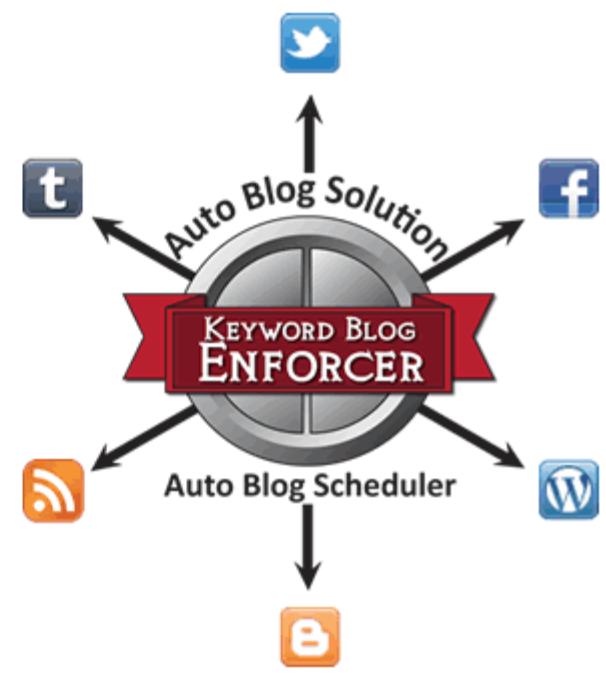
Social Media Auto Post Solution

You get an Auto Post Solution with an Auto Post Scheduler that will autopost your Messages to Blog Networks, RSS Feeds, Search Engines and Social Media. The Keyword Blog Enforcer automates creating blog posts and social media posts that will Autopost your messages. Autopost messages to Search Engines like Google, Yahoo, and Bing. Autopost messages to Social Media like Facebook and Twitter. Autopost messages to Blog Networks like Blogger, Wordpress and Tumblr. Autopost is a way to easily get your business' industry, products and services published to multiple social networks and seen by leads, prospects and consumers.