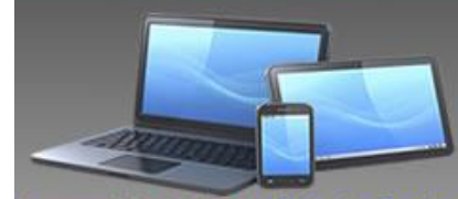
Internet Marketing + Website Design All-in-One Website Solution