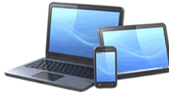
Internet Marketing + Website Design