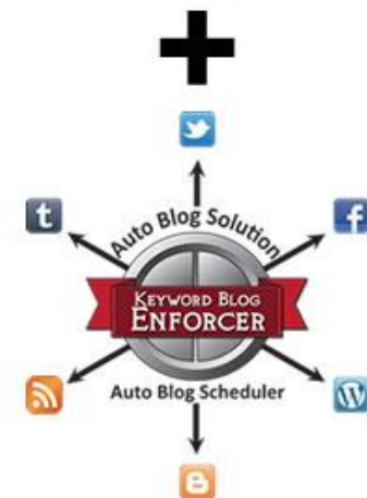
Social Media Auto Post Solution