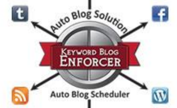
Social Media Auto Post Solution