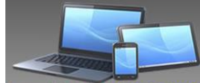
Internet Marketing + Website Design All-in-One Website Solution