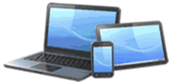
Internet Marketing + Website Design All-in-One Website Solution

Combine Our Three Powerful Solutions into the Ultimate Automated Internet Marketing Plan