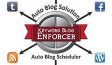
Social Media Auto Post Solution