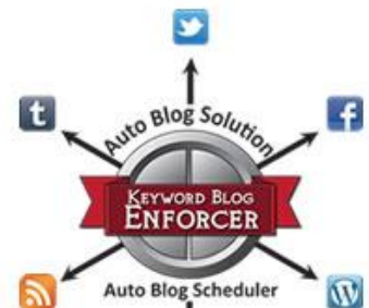
Social Media Auto Post Solution