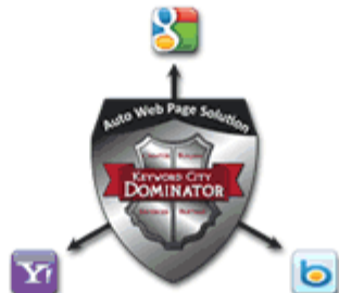
Auto Web Page Solution